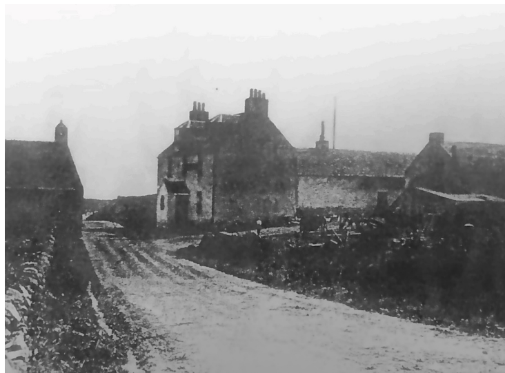
On the right is South Ardminish Farm, an 18th century farmhouse which is now Gigha Hotel. On the opposite side of the road is Gigha Parish Church. It was built on this site between 1707-12 but had fallen down by 1772. It was rebuilt on the same site in 1780.