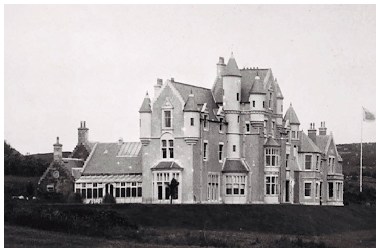
Pre 1884 view of the 'Mansion House' before it was remodelled to become Achamore House.