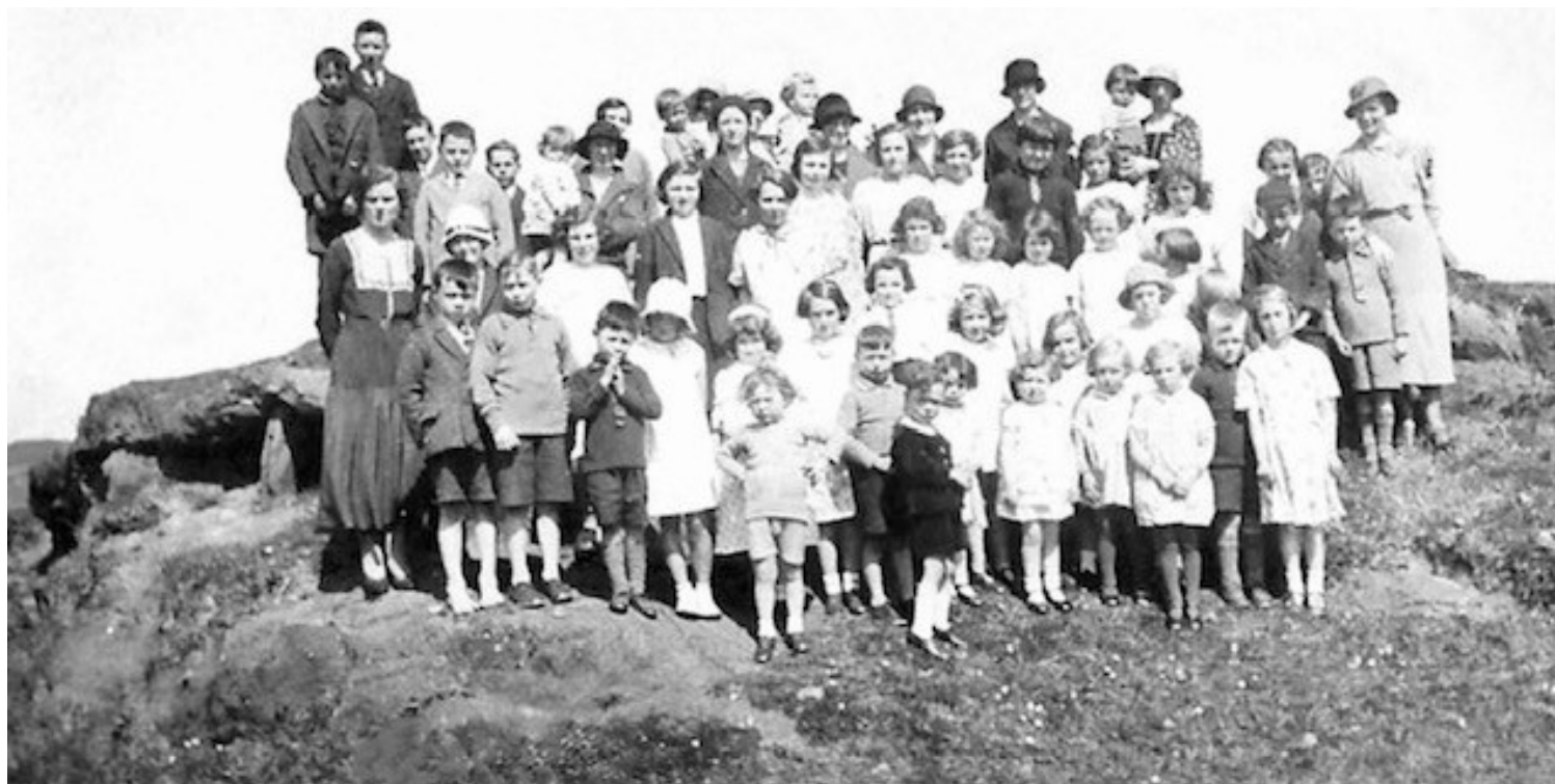
Jubilee Tea party on Gigha in 1935.